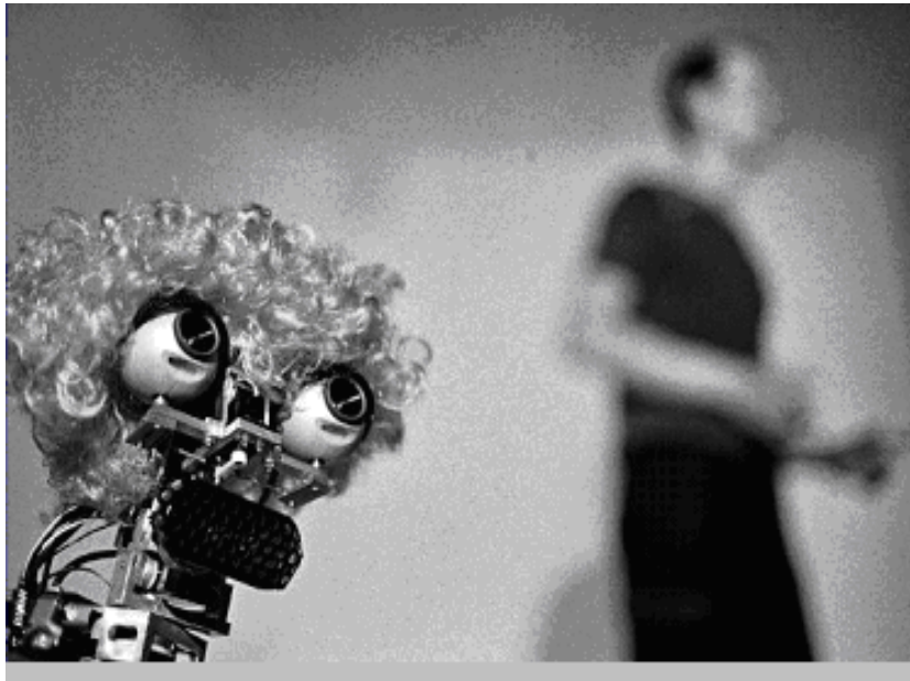
Figure 2. Media Lab Europe’s “JoeRobot”

In fact, if robots are too human-like, then we would have more difficulty in accepting them. If the robot is perceived as being human, then effectively it should be human and not a robot in form and function. Even if one succeeded and could build a perfect robot reproduction of a man or woman, what would it do? It would in fact only do what we can do, no more, and no less (this discussion does not incorporate aspects of human augmentation). The addition (or subtraction) of any attribute not pertaining to our human form and function results in a deviation from the original holy grail of building an artificial human. Building a robot to replicate the form and function of the human as closely as possible could “only” be for creations to replace us and give rise to the fear of robots “taking over the world”.