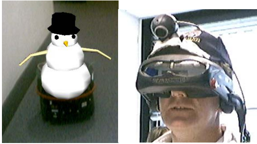
Figure 2: (a) An Augmented Reality socially situated agent, (b) a head mounted display used to view the AR scene.

IBM's ViaVoice (is used as speech recognition system for simple vocal control