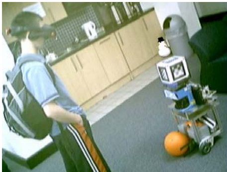
Figure 3: Example of child playing football with SoSAA using augmented reality.